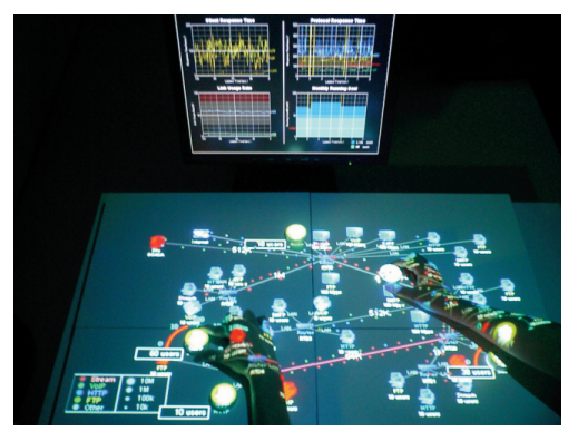
Fig. 1. Consulting support system.