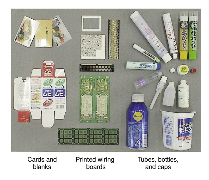
Fig. 1. Examples of inspection targets.

electronic-component manufacturers where inspection targets are printed wiring boards (bare boards), ceramic parts, display panels, connectors, and the like. Much of our effort here focuses on the inspection of bare boards and IC-mounting boards that suffer from fine defects such as smudges, scratches, and omissions on the order of a few tens of micrometers. In this area, we developed the industry's first equipment to fully automate visual inspection that has traditionally been done by the naked eye. The third user category is container manufacturers where inspection targets are solid objects with nearly cylindrical shapes such as tubes, bottles, cans, cups, and caps. This field has been growing dramatically in recent years, and we are proud of our dominant share in the market for inspecting aluminum and plastic tubes for pharmaceutical products and foods where other companies cannot approach our quality.