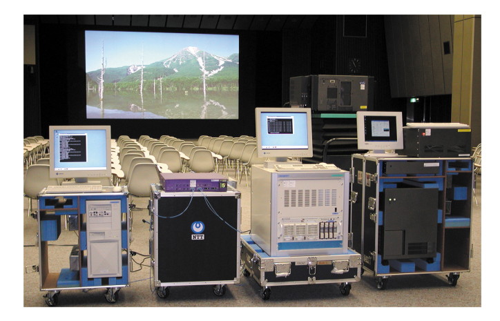
Fig. 1. SHD digital cinema distribution system. From the left: PC-server, GbE-hub, JPEG2Krealtime decoder and projector (GbE: gigabit Ethernet).

"4K" for approximately 4000 pixels horizontally. Picture quality in movies is expressed by the number of pixels in the horizontal direction. Thus, HDTV, which has 1920 pixels horizontally, is called a "2K" system. While existing versions of digital cinema are mostly based on the HDTV 2K level, our 4K system corresponds to the world's highest level of image