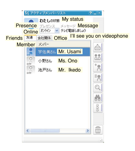
Fig. 3. Screen showing the active member list.

The PCC whiteboard can also be used independently when communication with another terminal is not