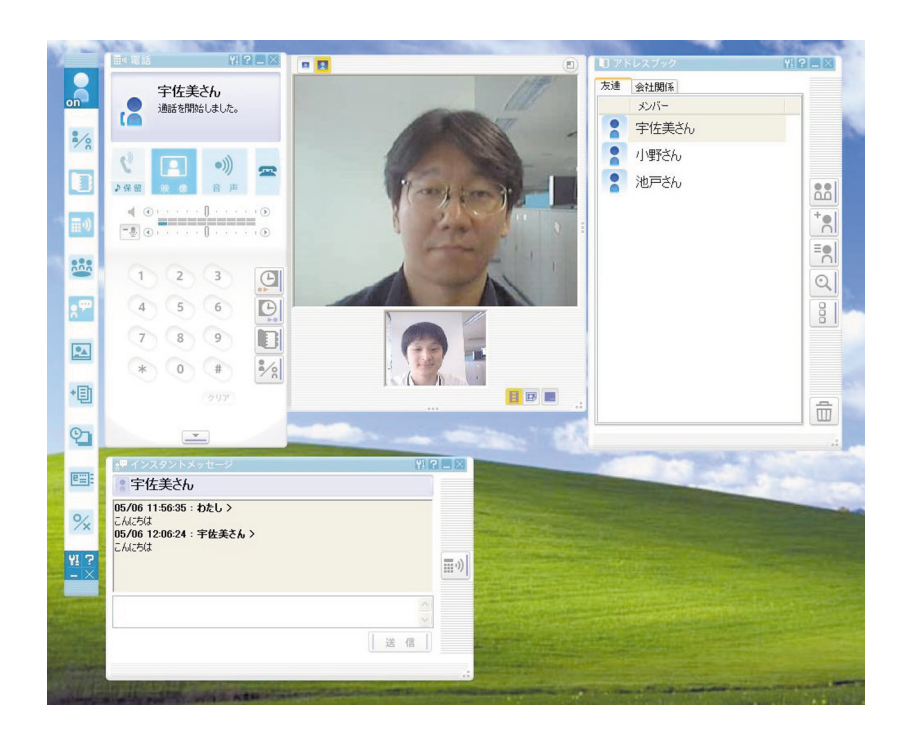
Fig. 2. Example of videophone screen.

terminals offered by companies in the NTT Group rather than just between the PCC client and .Phone Personal V. We intend to work towards greater use of the common specifications among all of the companies in the NTT Group.