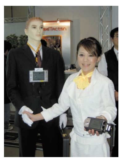
Fig. 8. RedTacton exhibit.

tion means of communication. These included a function for controlling home appliances using a familiar user interface, a function for starting up services by simply holding up something in front of the terminal. a function supporting remote operation, and a function that pro-