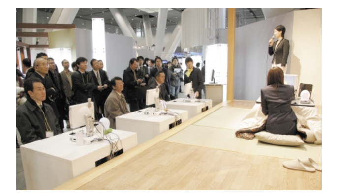
Fig. 4. The heartwarm@home demonstration.

across the large screens in the horizontal direction, made for a beautiful animated picture that provided the exhibition site with a Christmas-night performance. Pictures that people drew at the exhibit could also be viewed at home on their own personal computers over the Internet [3].