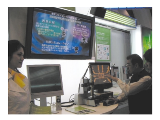
Fig. 9. Quantum computer exhibit.

Finally, in the demonstration introducing an experience that melds galvanic vestibular (inner-ear) stimulation with sensory computer graphics, a feeling of acceleration obtained by sending weak electric cur-