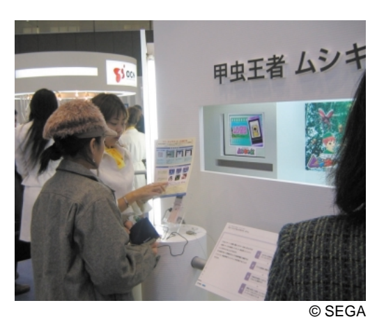
Fig. 6. Character stand exhibit.

Technology Lab. was set up to publicize the diversity of NTT R&D, the interlinking of NTT technologies, and the high level of individual NTT technologies that provide strong support in diverse ways for the NTT Group and its work