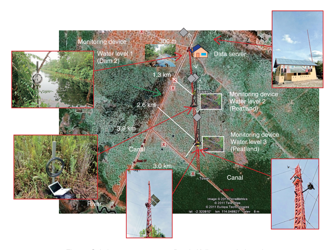
Fig. 1. Solution to suppress peat fires in Kalimantan, Indonesia.