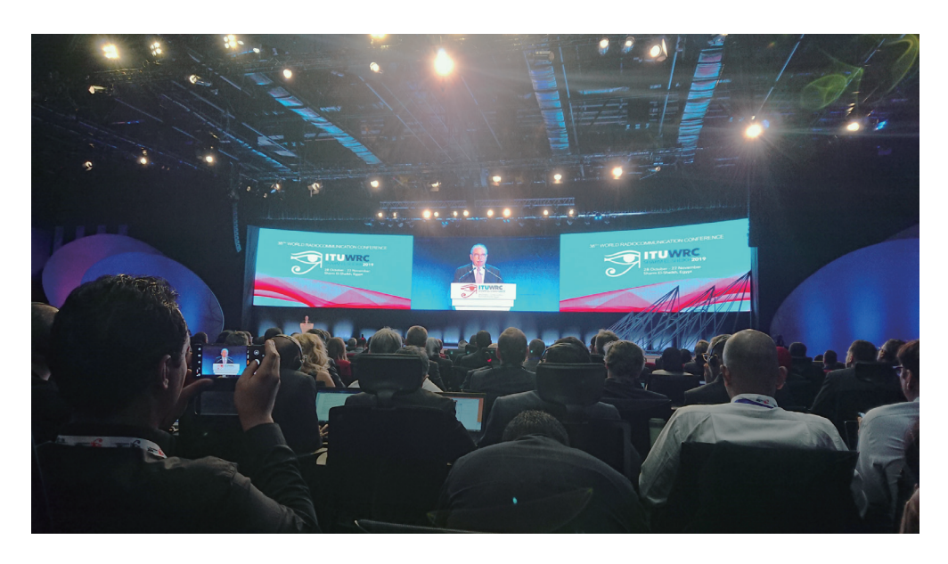
Fig. 1. WRC-19 meeting at the opening ceremony.

access systems including wireless LAN in the 5-GHz band (5.15-5.925 GHz), meaning studies of the revisions to the RR to expand the use of 5-GHz band wireless LAN. Studies to enable outdoor use of wireless LAN and higher transmission power in the 5.2-GHz band (5.15–5.25 GHz) are especially relevant to Japan. In the RR, use of wireless LAN indoors and outdoors in the 5.6-GHz band was already permitted under certain conditions, but the 5.2-GHz band was restricted to indoor use only. Maximum equivalent isotropically radiated power (EIRP) was allowed up to 1 W in the 5.6-GHz band, while limited to 200 mW in the 5.2-GHz band. The reason for this was that the 5.2-GHz band was already in use internationally by other systems, such as satellite communications, so there was concern that there could be harmful radio interference if wireless LAN was used outdoors.