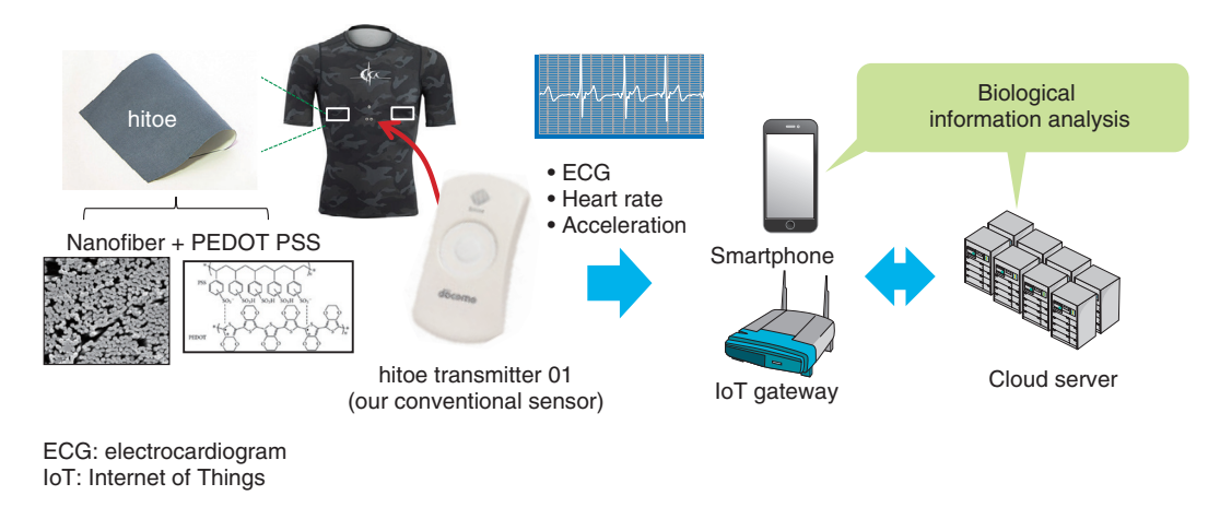
Fig. 1. Biological sensing system with hitoe<sup>™</sup>.

innerwear and connected to the hitoe electrodes via snaps on the garment. The measured data are sent to the smartphone for visualization then sent to the cloud servers for data storage and additional signal processing. This hitoe wearable sensing technology was applied for various applications such as sports, worker safety, and rehabilitation [3, 4].